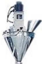
Auger Filler Device (Powder)