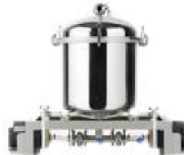
Gravity Dosing Device (Liquids)